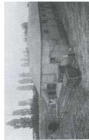
LODGE HILL MAGAZINE