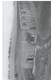
LODGE HILL MAGAZINE